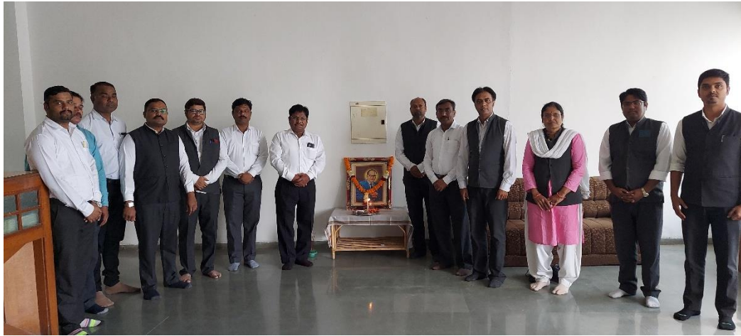
Dr. Babasaheb Ambedkar Death Anniversary Celebration (06-12-2022)