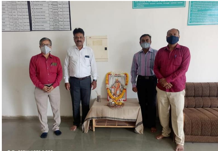
Chhatrapati Shivaji Maharaj Birth Anniversary Celebration (19-02-2022)