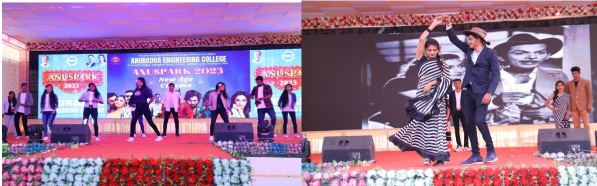
Dances during Anuspark

All world cinema was categorized into different era like black & white era, Golden era, Blockbuster era, Bollywood Era, New age Cinema. Students and staff actively participated.