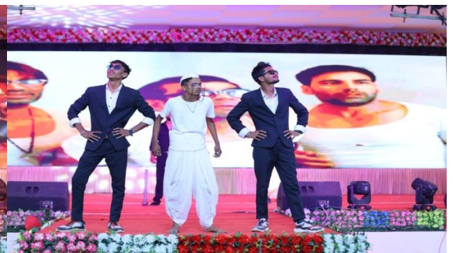
Fashion Show during Anuspark