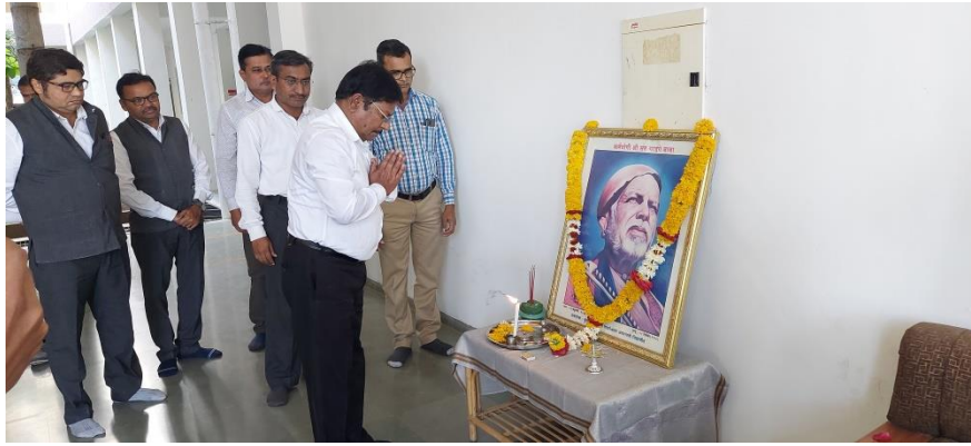
Sant Gadge Baba Death Anniversary Celebration (23-02-2022)