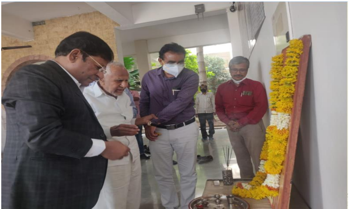
Jijamata and Swami Vivekanand Birth Anniversary Celebration (12-01-2022)