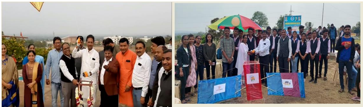
Kite Festival (24-01-2023)

Some of them includes Satellite Kite, Eagle Kite, Macau Bird Kite, Butterfly Kite, Dragon Kite, Aeroplane Kite, Parachute Kite, Bicycle Kite, AEC Box Kite etc. The idea behind making of each kite was explained by respective departmental students.