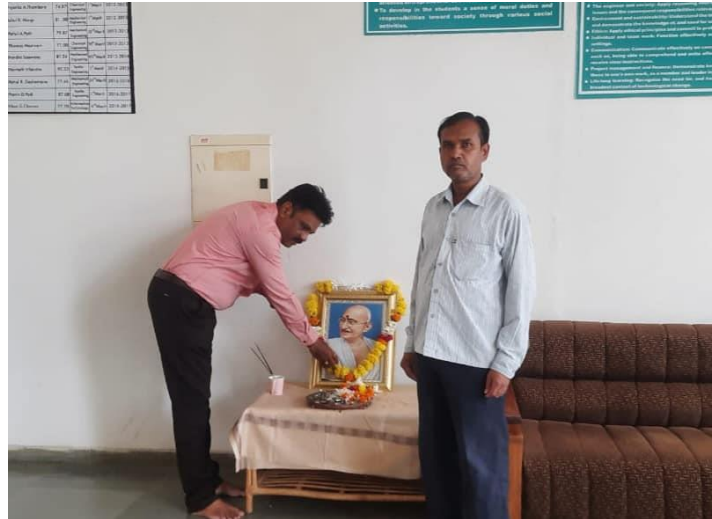
Mahatma Gandhi Birth Anniversary Celebration (02-10-2022)