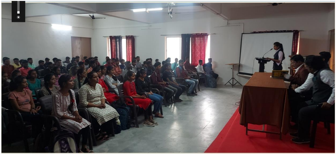
Sanvidhan Divas Celebration (26-11-2022)